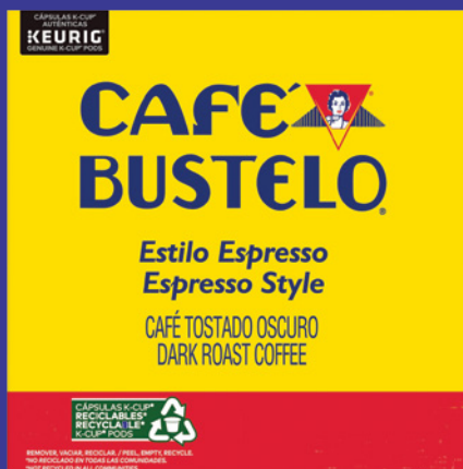
CAFE BUSTELO® Espresso Style 48 ct