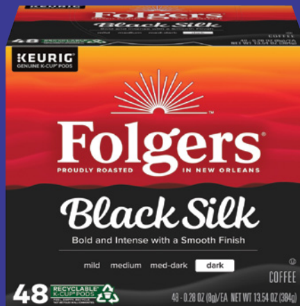
FOLGERS® COFFEE Breakfast Blend, Black Silk 48 ct